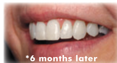
* 6 months later