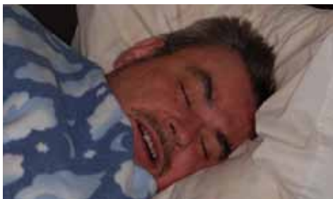
After: Now he sleeps great with an oral appliance from Port Warwick Dental Arts

Sleep apnea is a serious medical condition.