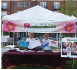
Come see us "On the Square" at Port Warwick Wednesday, Sept. 10

Come to the concert to learn how to win a $1250 gift certificate to PWDA, a free $750 professional whitening or a $50 gift certificate to any of the fabulous restaurants in Port Warwick.